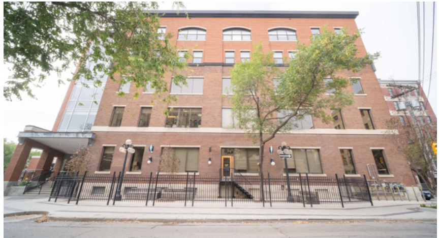
The exterior of the building housing MCC Manitoba's new offices at 140 Bannatyne Avenue, Winnipeg. The café Sam's Place, where MCC Manitoba's youth program takes place, is located on the main floor.

Over the past year, MCC Manitoba staff said goodbye to two longstanding office homes. We give thanks for many years and blessings on Plaza Drive and Henderson Highway. With our transition to one office, we prayerfully anticipate many new blessings, friendships and partnerships at our new home on Bannatyne Avenue.